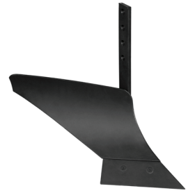
PLOUGH 588 26 67-01