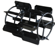
HUSQVARNA PADDY WHEEL KIT - EMM 588 26 68-01