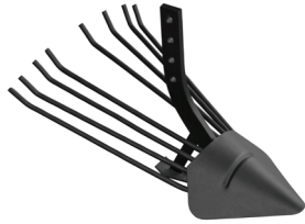
HUSQVARNA POTATOES HARVESTING PLOUGH 588 26 61-01