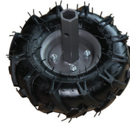
RUBBER WHEELS KIT 588 26 69-01