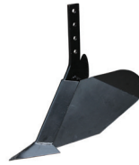
HUSQVARNA DITCHING BLADE 588 26 64-01