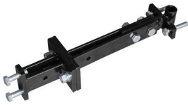
HUSQVARNA CONNECTING BRACKET B-TYPE 588 26 60-01