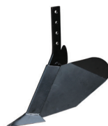
HUSQVARNA DITCHING BLADE 588 26 64-01