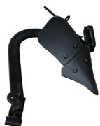
HUSQVARNA PLOUGH 501 65 29-01