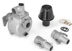
HUSQVARNA WATER PUMP 589 52 72-01