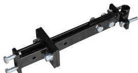
HUSQVARNA CONNECTING BRACKET B-TYPE 588 26 60-01