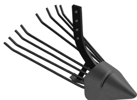
HUSQVARNA POTATOES HARVESTING PLOUGH 588 26 63-01