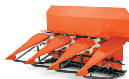
HUSQVARNA SWATHER ATTACHMENT 590 36 60-01