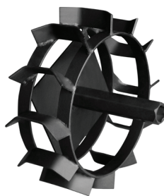
HUSQVARNA METAL WHEEL KIT - EMM 501 65 42-01