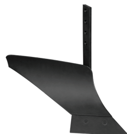
PLOUGH 588 26 67-01