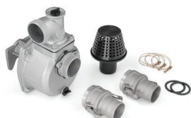
HUSQVARNA WATER PUMP 589 52 72-02