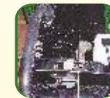
Radiator with Overflow Reservoir