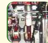
Oil Jet for Piston Cooling