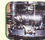
Dry Type Air Filter