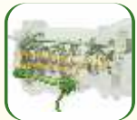
Top Shaft Lubrication