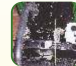
Radiator with Overflow Reservoir