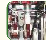
Oil Jet for Piston Cooling