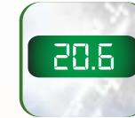
Digital Hour Meter