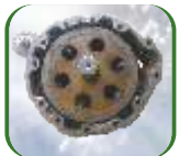
Oil Immersed disc brakes