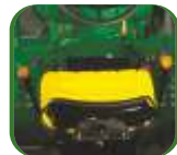
Side Shift Gears