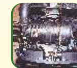
Dry Type Air Filter