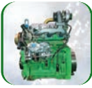
John Deere's New Powerful 3029H Turbo charged engine with Inline FIP