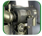
Dry type air filter Ease of maintenance and longer engine life