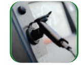
Mobile Charging Point with Holder