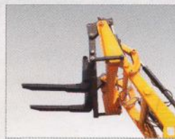
agriBULL Forklift Bucket