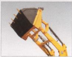
agriBULL 6 in 1 Bucket