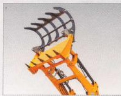
agriBULL Grabbing Bucket