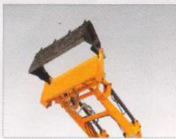
agriBULL 6 in 1 Bucket