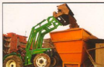
Material handling at Batching plant