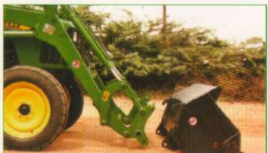
BQRSL mechanism Ease of bucket interchangeability