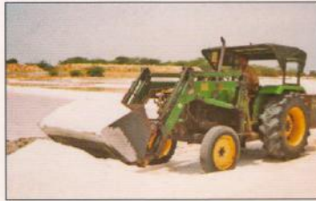
Loader at salt industry