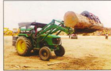
FEL with grabbing fork handling wood