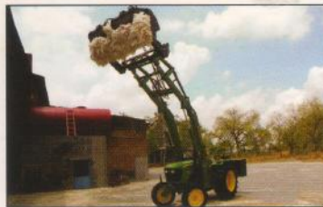
Ultra loader with 15.5 ft dump height for loose cotton handling