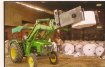
Loader with reel handling attachment on bale grabber