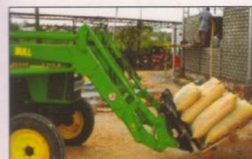
Loader for cement bags handling