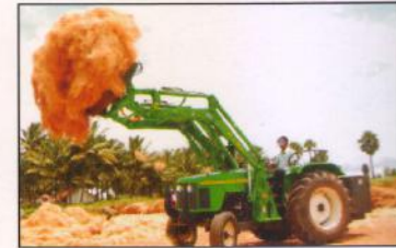
Loader for Coir handling