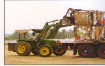
FEL with grabbing fork handling paper bale