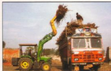
Loader for sugarcane handling