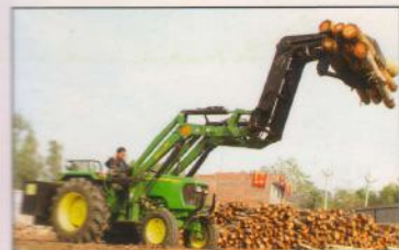
FEL with Sugarcane grabber handling wood