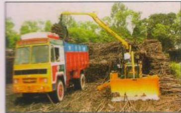
Radial loader for loading & unloading wood