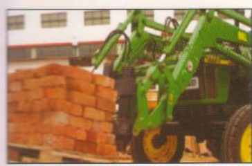
Loader for bricks handling