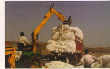
LRL with unloader unloading cotton