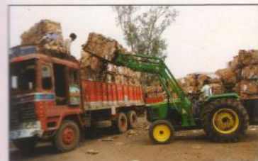
Loading Paper bales with fork lift