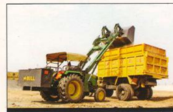
Telescopic Loader Loading Husk In Truck