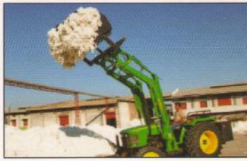
Loader for loose cotton handling