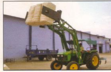
Loader for handling cotton bales