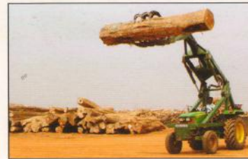
Ultra Sugarcane Loader Handling Wood