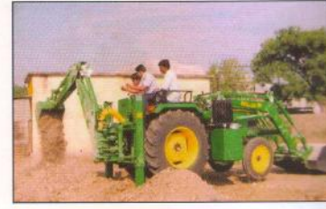
Backhoe Loader for excavation work