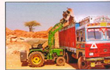
High Dumping @ 13.12ft tallest loader in India